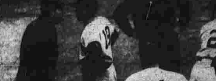
Leo Durocher, manager of the Yankees, is shown in a moment of conversation with players on the field.