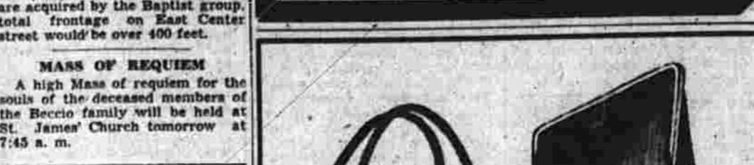
Smart new styles in Cotton Velour and failles. Top handbag, box style also small envelope styles. New fall colors.

MACHINE SPREAD • FREE GRADING • FREE ESTIMATES • POWER BOLDED • WORK GUARANTEED • TERMS ARRANGED • EXPERIENCE SINCE 1920